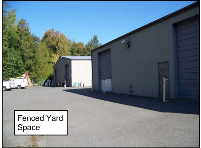
Fenced Yard Space