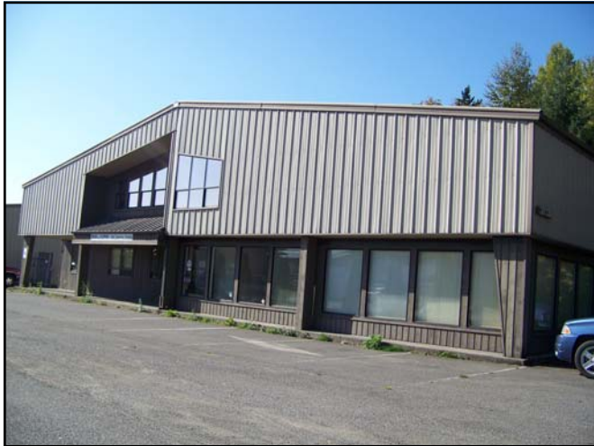
Front of Office/Showroom