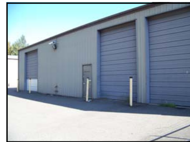
Back of Warehouse/ Manufacturing building